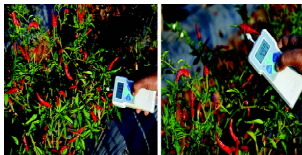
Fig. 2. Images showing fruit detachment force with digital force gauge

The force of detachment or pulling force of fruit to separate from the chilli plants was measured using digital force gauge (Fig. 2), which can measure maximum 50 Newton (N). The digital force gauge used for the experiment was Model No. SF-50, maximum load 50N and the least count of the instrument was 0.01N. The push and pull type digital force gauge was held with one hand one side