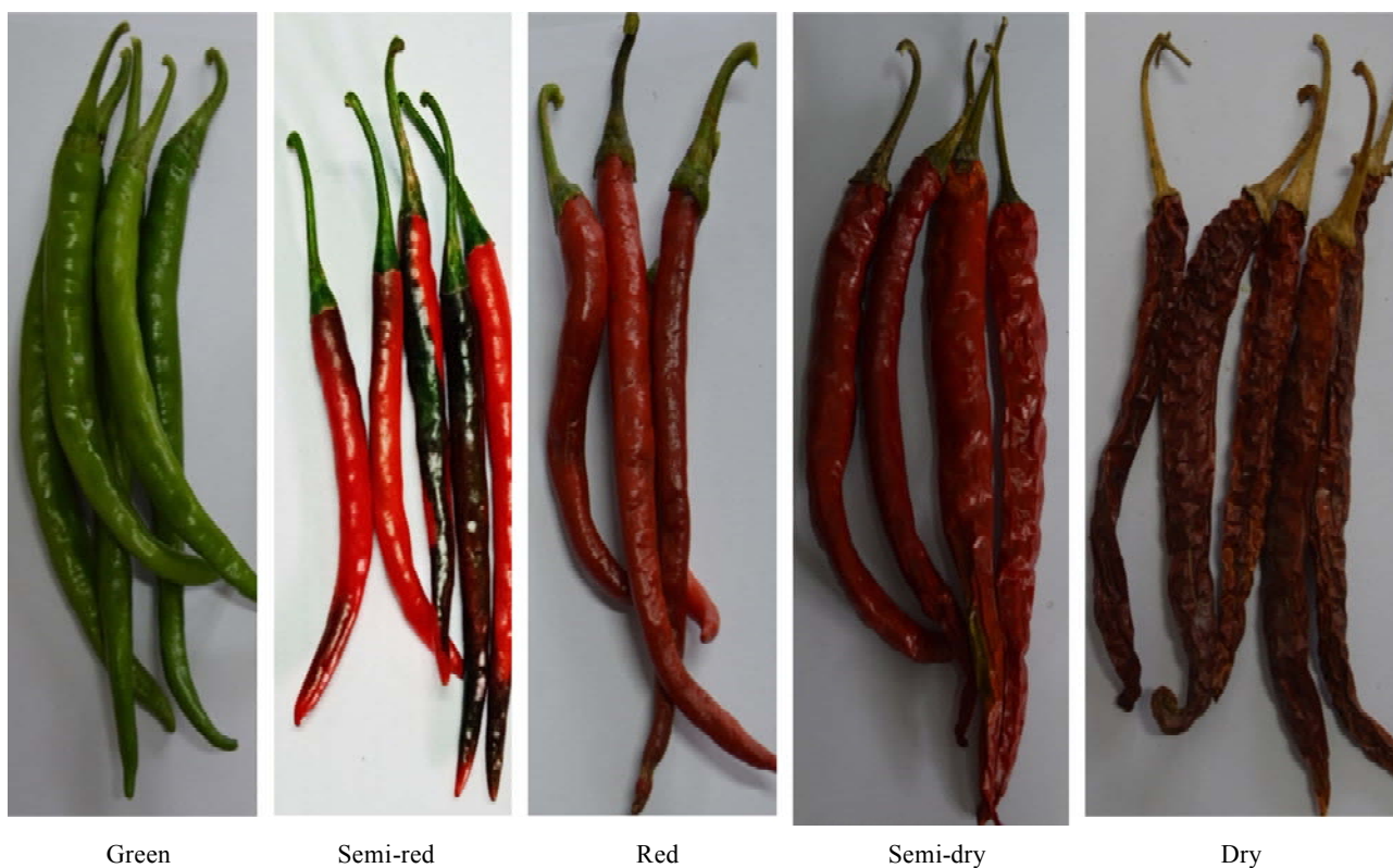
Fig. 3. Image shows different stages of Arka Meghana cultivar

The statistical analysis was carried out for the each observed character under the study using MS-Excel. The mean values of data were subjected to analysis of variance as described by (Gomez and Gomez, 1984).