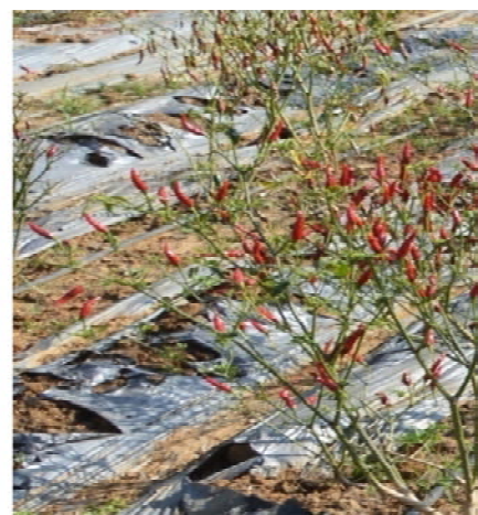
Demon F 1