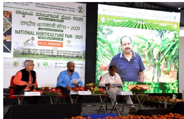
Technical Session in progress