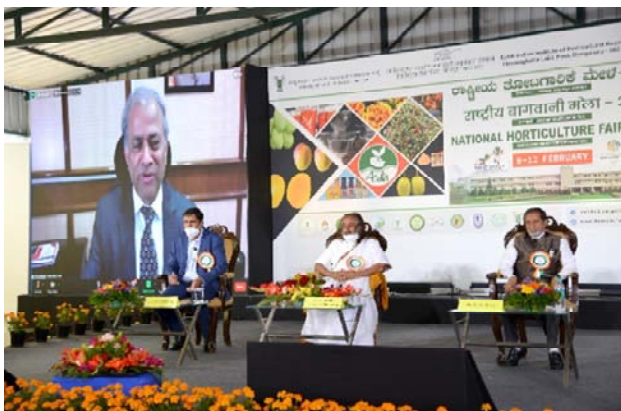
Inauguration function of NHF-2021

The foot fall for the physical fair in all the five days was to the tune of 56,243. Six workshops / training programmes were conducted during the event days on; Terrace Gardening (Vegetable growing and medicinal plants for home remedies), Soilless Vegetable Cultivation, Home Scale Processing (Fruits: Lime, Orange, Vegetables: Tomato, Onion, Chilli, Flowers: Rose, Brine Preservation / Pickling), Safe Plant Health Management in Hobby Horticulture, Mushroom Products, Workshop on Hydroponics for Terrace & Peri urban horticulture, and Modern irrigation Technologies in Horticultural Crops. A total of 691 participants attended these workshops. Eleven Farmers from six different states of the country who have adopted ICAR IIHR technologies and one extension worker from Manipur who was instrumental in popularizing the ICAR IIHR technologies were felicitated during the fair.